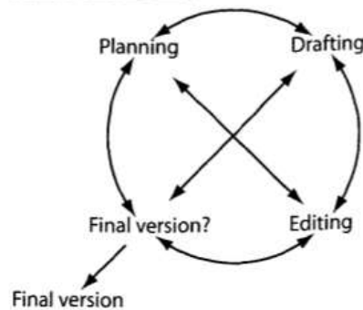
FIGURE 1: The process wheel

According to White and Arndt in Harmer (2007: 326) stress that writing is re-writing ... re-vision- seeing with new eyes-has a central role to play in the act of creating text.